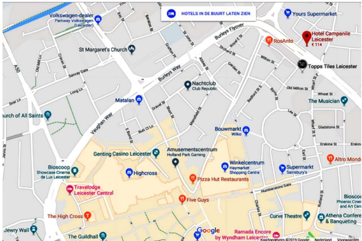
SURROUNDING OF THE HOTEL